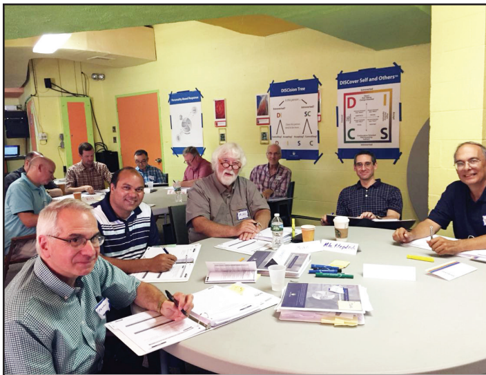
Priests attend “Good Leaders, Good Shepherds” leadership program.

I’m concerned about them, however. Many are overburdened, at times overwhelmed, and unable to be the priests they desire to be because so much of their day is caught up with administrative responsibilities. Many are responsible for doing today what even a short time ago three or more priests were responsible for. Their excessive workload leads many to neglect their physical and emotional health, and some their Spiritual health.