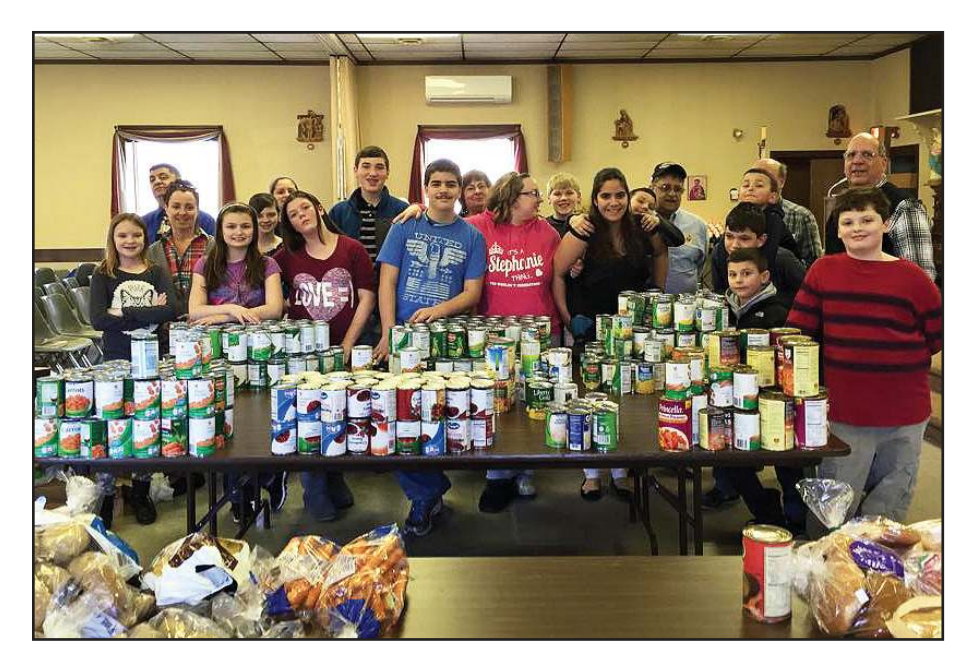
"For I know the plans I have for you, declares the LORD, plans for wholeness and not for evil, to give you a future full of hope" Jer 29:11.

These are but a few examples, certainly not exhaustive. Others will be discerned from listening to our stakeholders.