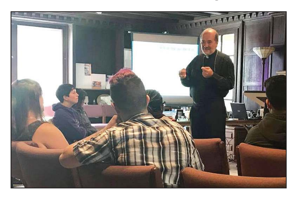
"For I know the plans I have for you, declares the LORD, plans for wholeness and not for evil, to give you a future full of hope" Jer 29:11.

"The Bishop must always foster missionary communion in his Diocesan Church, following the ideal of