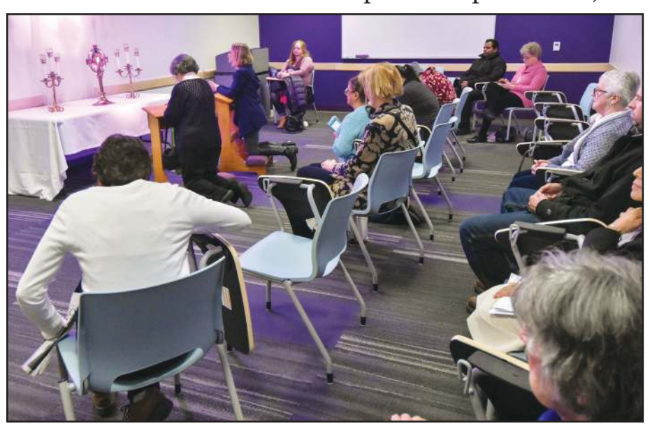
"For I know the plans I have for you, declares the LORD, plans for wholeness and not for evil, to give you a future full of hope" Jer 29:11.

"With its universal and indispensable provisions, the