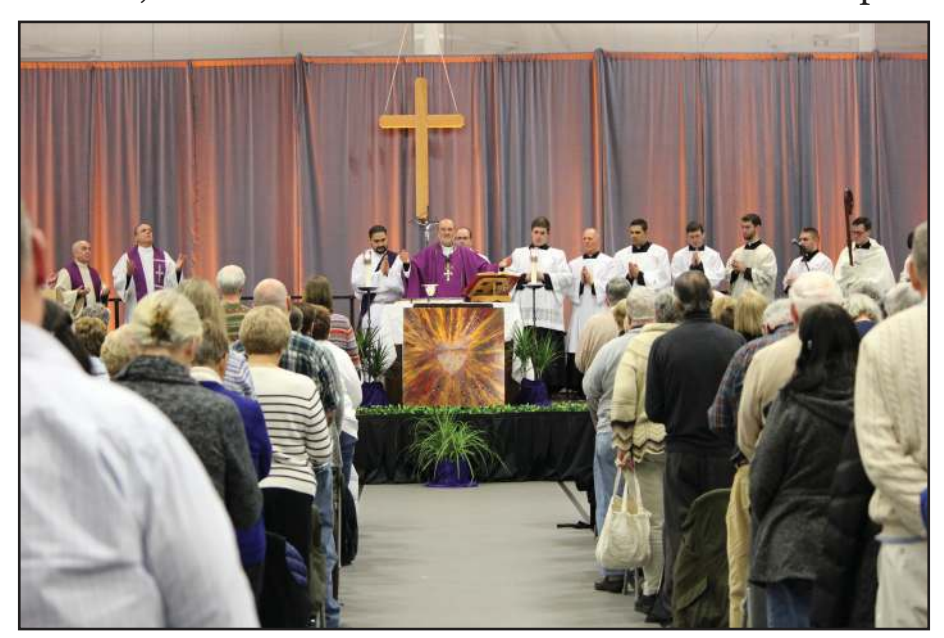
"For I know the plans I have for you, declares the LORD, plans for wholeness and not for evil, to give you a future full of hope" Jer 29:11.

A strategic planning effort is getting started with a pilot group of 10-12 parishes. A step-by-step framework has been developed to guide each parish through this planning process to ensure wide consultation, a thorough assessment of all aspects of the parish, and the formulation of an action plan that is specific, measurable, and realistic. Facilitators from outside the par-